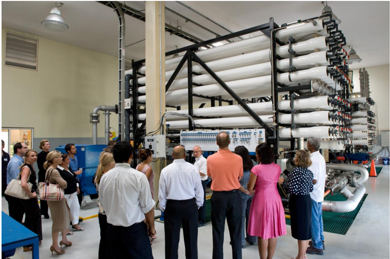
Reverse Osmosis Plant